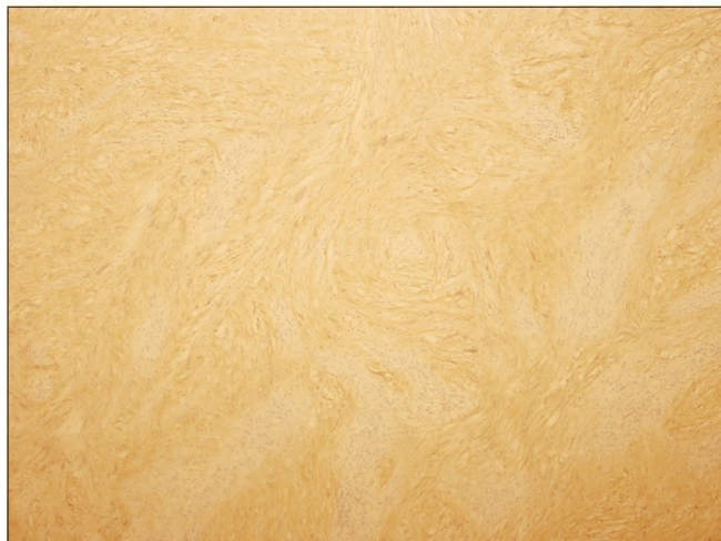
Figure 2: S-100 stain showing diffuse positivity \times 40 .

mild propensity to occur in women compared to men with an average age of presentation of 65 years of age. [5] This median age is congruent with this case's patient age. Another similar study that reviewed twenty-four cases of gastrointestinal tract schwannomas found that twenty-three of them arise from the stomach and only one case in the ascending colon. [6] This gastric-preferred location for gastrointestinal schwannomas has been documented in the literature.