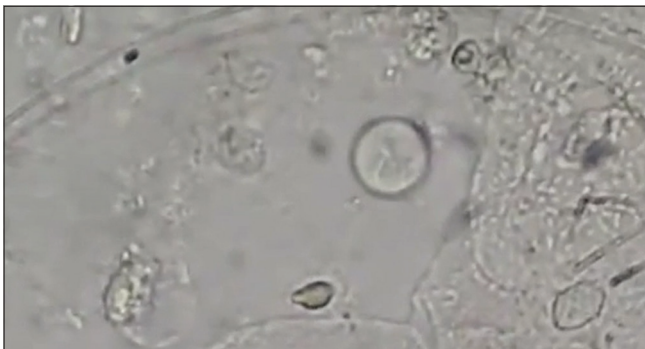
Figure 2: Urine microscopic examination of same patient- Trichomonas vaginalis -internal structure is also visible.

The laboratory findings revealed an elevated total leucocyte count with a predominance of neutrophils, indicating an inflammatory response to the infection. The inflammatory markers, including an elevated erythrocyte sedimentation rate and C-reactive protein level, further supported the diagnosis. While these laboratory parameters are nonspecific, they contribute to the overall clinical picture, emphasizing the need for a comprehensive diagnostic approach.