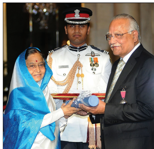
Figure 2: Dr. Prathap Chandra Reddy receiving “Padma Vibhushan” award from the President of India.