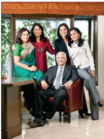
Figure 4: Dr. Prathap Chandra Reddy with his four daughters.

“Not every legend is a myth; some are flesh and blood. Some legends walk among us, but they aren’t born; they’re built. Legends are made from iron and sweat, mind and muscle, blood and vision, and victory. Legends are champions, they grow, they win, they conquer. There’s a legend behind every legacy, there’s a blueprint behind every legend.” – Arnold Schwarzenegger.